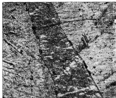
FIG. 1. Microstructure of gadolinium ( \times 200 ).

Figure 1 shows the microstructure of the distilled gadolinium. As can be seen, the grains have thin boundaries, and both the body and boundaries of the grains are practically free of nonmetallic inclusions; these, as is known, impede grain growth. The annealing produced a coarse-grained specimen with grain sizes from 3 to 12 mm diameter. A single crystal was cut from the specimen and was oriented by the Laue method. After each cutting operation, the surface of the metal was etched with a solution of nitric acid and alcohol, to a depth of 0.1 to 0.2 mm, to eliminate surface hardening.